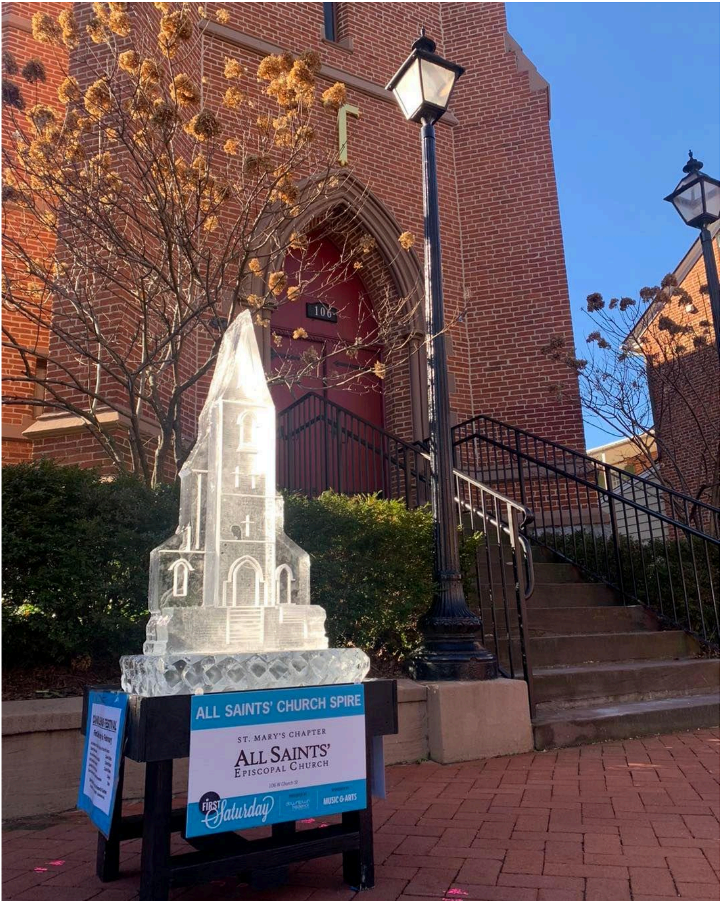
Fire In Ice Event - February 3, 2024